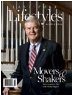
East Polk Lifestyles

removed the Confederate battle emblem from its state flag, and the University of Mississippi retired Col. Rebel at its on-field mascot.